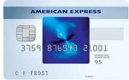
Choice Card from American Express

$0 Each supplementary Card $0/year 19.99% on purchases 21.99% cash advances